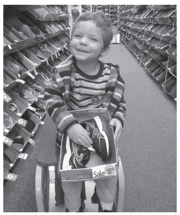
Early Head Start program participant picks out a pair of shoes thanks to the 100 merchandise certificates received from the Payless Gives Shoes 4 Kids program.

First Step had been chosen by Payless ShoeSource to receive 100 merchandise certificates through their Payless Gives™ Shoes 4 Kids program. Each merchandise certificate is redeemable for, or toward, a pair of children's shoes at any Payless ShoeSource store. Community Link accompanied some families enrolled in our Early Head Start program to the Payless ShoeSource store in Centralia and Shiloh to purchase shoes for children in need. ❖