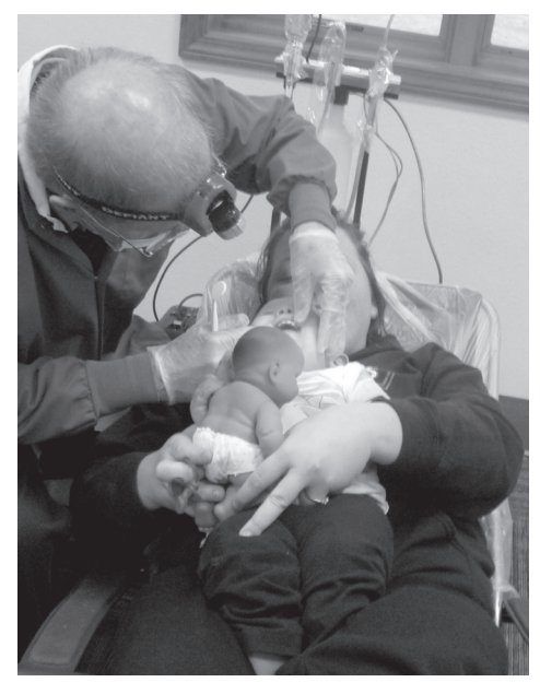
This little girl's mother helps the dentist from Smile Illinois Traveling Dental Group while a dental exam is being performed.

First Step held a Dental Clinic in February at Carlyle Christian Church in Carlyle. Smile Illinois Traveling Dental Group preformed the dental exams and cleanings on children age 1-18. Eight enrolled Early Head Start children, along with two older