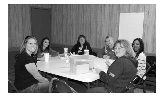
Breakout class with First Step staff