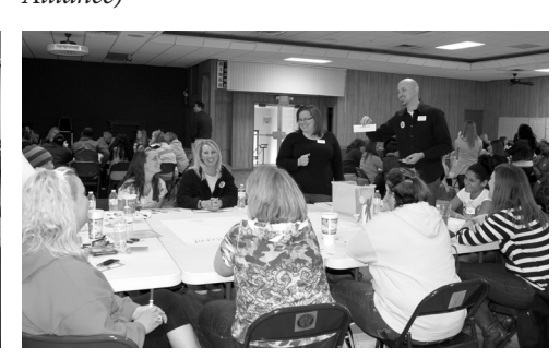
Breakout class with CILA staff